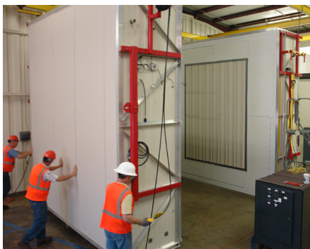
The Butler Guarded Hot Box tested actual in-place performance of the EX Wall Systems.

The BlueScope Guarded Hot Box precisely measures thermal conductance through insulated roof and wall system assemblies, which helps our research and development team create more sustainable, energy-efficient buildings.